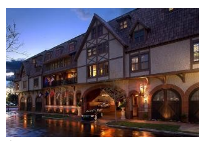
Grand Bohemian Hotel - Asheville

When making your reservations, mention or enter BMW10 for a 10% discount. <u>Click here</u> to visit their website.