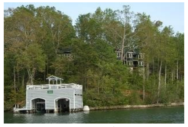
The Lodge on Lake Lure - Lake Lure, NC