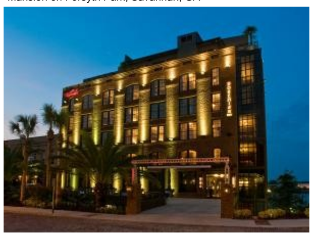
The Bohemian Hotel, Savannah Riverfront

Discounts on stays at The Bohemian Hotel can be reserved by calling 877.486.9575 or visiting their website at <a href="https://www.bohemianhotelsavannah.com">www.bohemianhotelsavannah.com</a>. If visiting the website, select Company and enter BMW for the Code in the Rates & Packages field to obtain the discount.